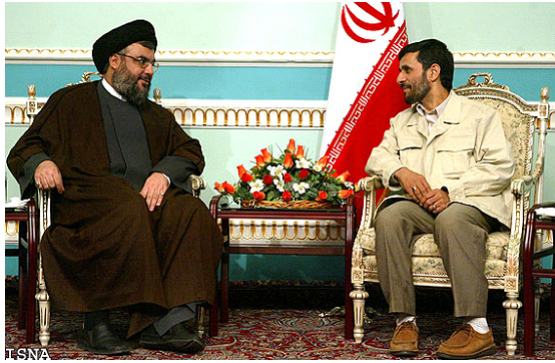
Picture 10: Iran's President, Mahmoud Ahmadinejad and Hezbollah's Secretary General, Hassan Nasrallah

Iranian authorities do not hide the importance they attach to these groups and their potential impact on their respective societies. This applies to organisations such as Hezbollah in Lebanon, the Palestinian Hamas movement, a large section of the Shiite community in Iraq and significant Shiite constituencies in both Kuwait and Bahrain and the eastern parts of Saudi Arabia. If Tehran is expected to use its influence with these groups as part of its retaliation against a military attack, it would equally be plausible that such influence be correspondingly enhanced by Iran's newly acquired nuclear posture.