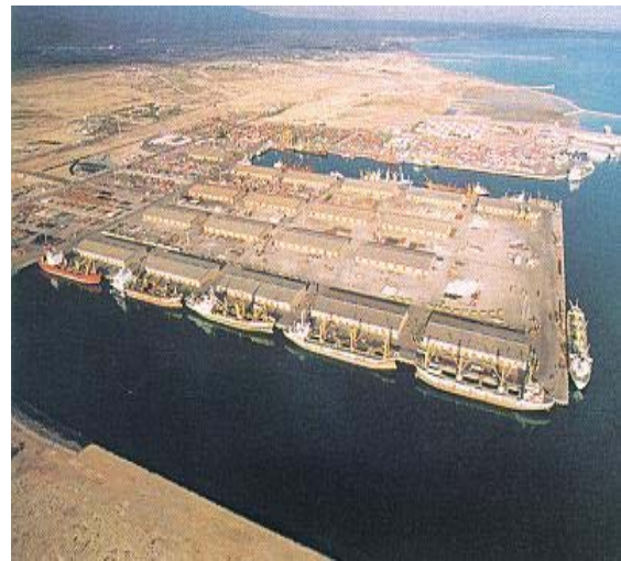
Picture 8: The strategically located Bandar Abbas Port is a likely target in a broader campaign aimed at neutralising Iran's military capabilities and minimising Iran's retaliatory actions.

Rather than being merely aimed at halting Iran's nuclear plans this would be directed at paralysing its armed forces and preventing any meaningful conventional retaliation by Tehran.