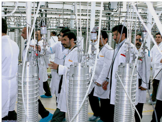
Picture 3: President Ahmadinejad on a visit to Natanz enrichment facility

Iran eventually signed - but did not ratify - the Additional Protocols agreement with the IAEA in December 2003 and agreed to a temporary suspension of its enrichment activities. Iran and the European Union signed the Paris Accord in October 2004. However, Tehran rescinded these agreements in January 2006 by removing the UN seals at its Natanz enrichment plant and resumed its research on nuclear fuel. By April 2006, Iran publicly announced its enrichment activities. Regardless of whether it was a publicity tool to present a threat, or simply a statement of fact affirming his country's true intentions, Iran's President, Mahmoud Ahmadinejad announced that Iran had enriched uranium to 3.6 percent. 1